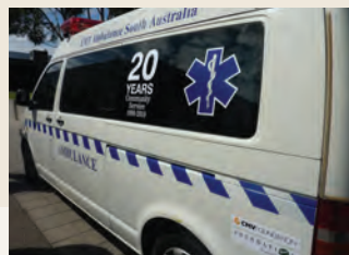
EMT Ambulance ensuring quality care for the poor and homeless.

In conjunction with the CMV Foundation, to purchase an ambulance to enable emergency transport and care for the poor and homeless.