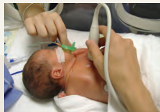
Flinders Medical Centre having life saving equipment to help premature babies.

To part fund a Cardiac Assessment System offering best treatment to critical premature babies.