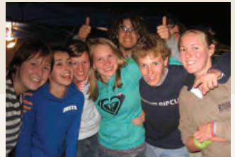
Schools Ministry helping young people discover their potential and build life long friendships.

To fund the costs of critical home care for 12 overseas children following surgery in Australia.