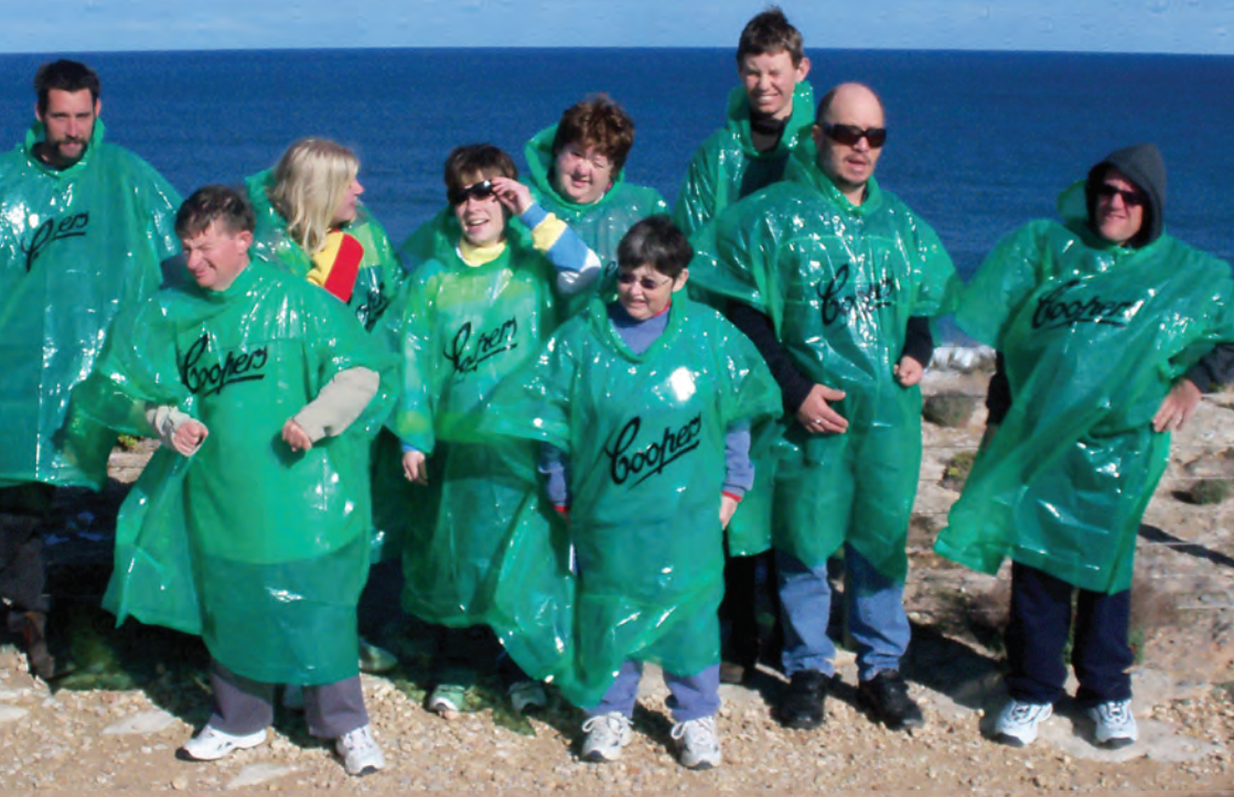
Bedford clients enjoying an unforgettable adventure.

The Coopers Brewery Foundation aims to improve and protect the quality of life of Australians, by providing support to charitable organisations with recognised strengths in medical research and health care, in youth education and aged care, and in fostering family and community support based on Christian values.