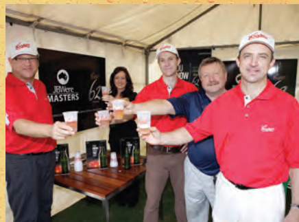
Participants at this year's Golf Day enjoying the Pilsner 62 sampling hole.

We extend our heartfelt thanks again to our numerous sponsors and volunteers who contributed to the day's activities and success, acknowledged in our Founding Friends supporter list.