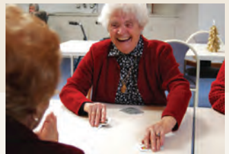
St Hilarion Aged Care making life a little easier as one gets older.

To enable the 'Living Skills' program for homeless and disadvantaged youth to continue for another year.