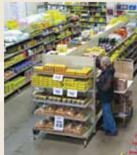
Community Food's new grocery section