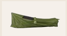
International award winning swag