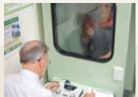
A Tasmanian student receives a hearing screen