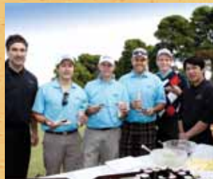
Teams enjoying sushi at the InterContinental sponsored hole

Our thanks are again extended to everyone who contributed to its success, raising significant support for South Australians diagnosed and affected by this debilitating disease.