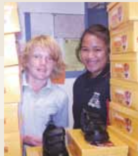
School children with their new shoes

To part fund a new occupational therapy kitchen to assist elderly patients practice preparing food prior to returning home.