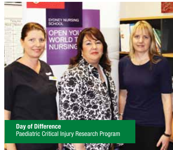
Day of Difference Paediatric Critical Injury Research Program