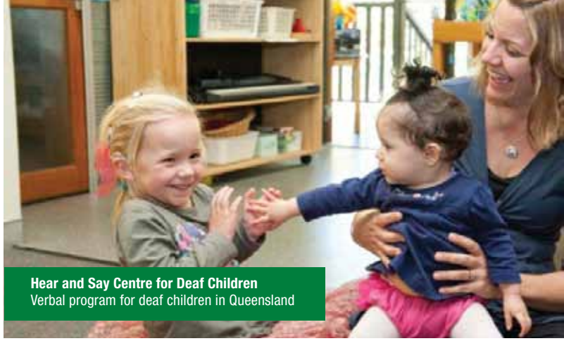
Hear and Say Centre for Deaf Children Verbal program for deaf children in Queensland