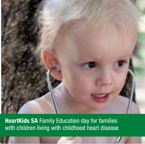
HeartKids SA Family Education day for families with children living with childhood heart disease