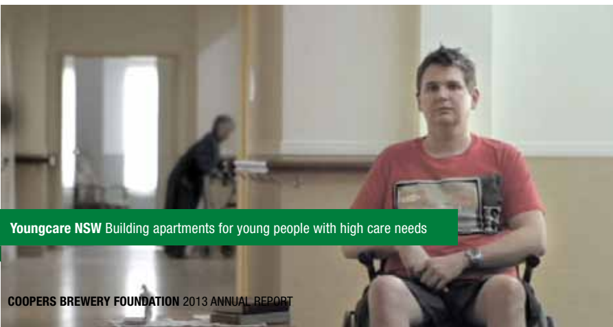
Youngcare NSW Building apartments for young people with high care needs