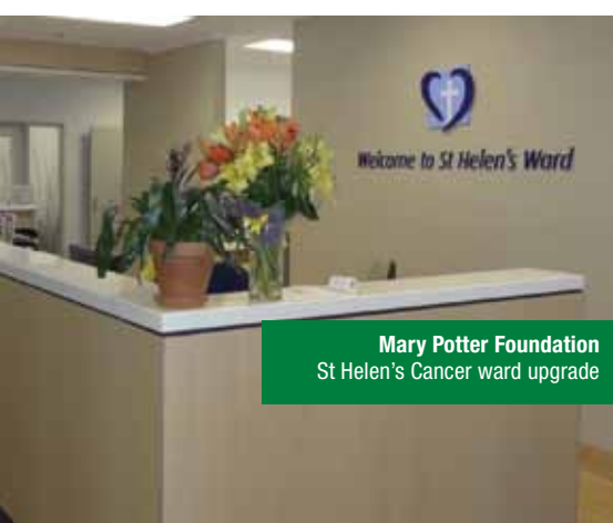
Mary Potter Foundation St Helen's Cancer ward upgrade