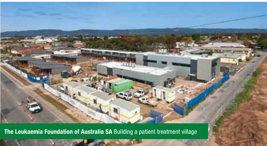
The Leukaemia Foundation of Australia SA Building a patient treatment village