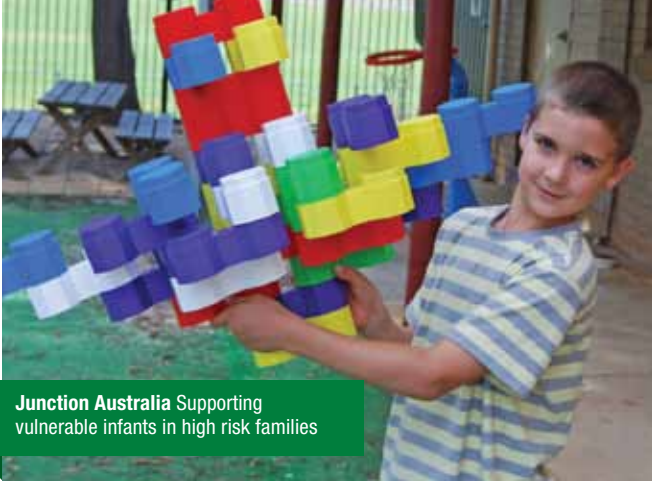
Junction Australia Supporting vulnerable infants in high risk families