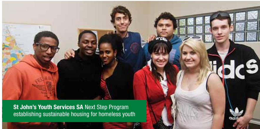
St John's Youth Services SA Next Step Program establishing sustainable housing for homeless youth