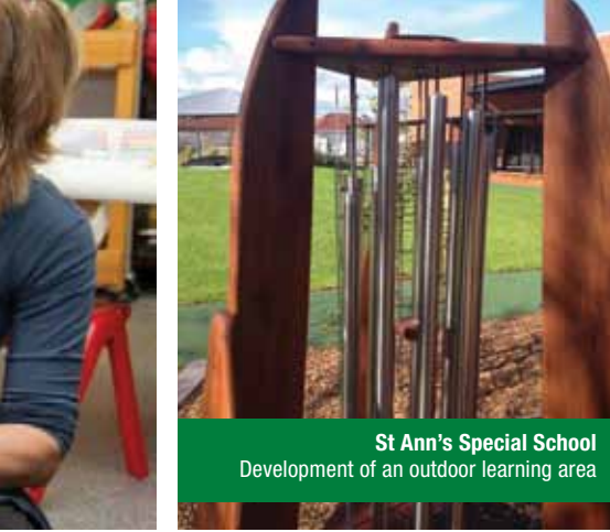
St Ann's Special School Development of an outdoor learning area

Selection of the past year's beneficiaries was based on the principles of the Foundation's Mission Statement and the merits of the projects submitted.