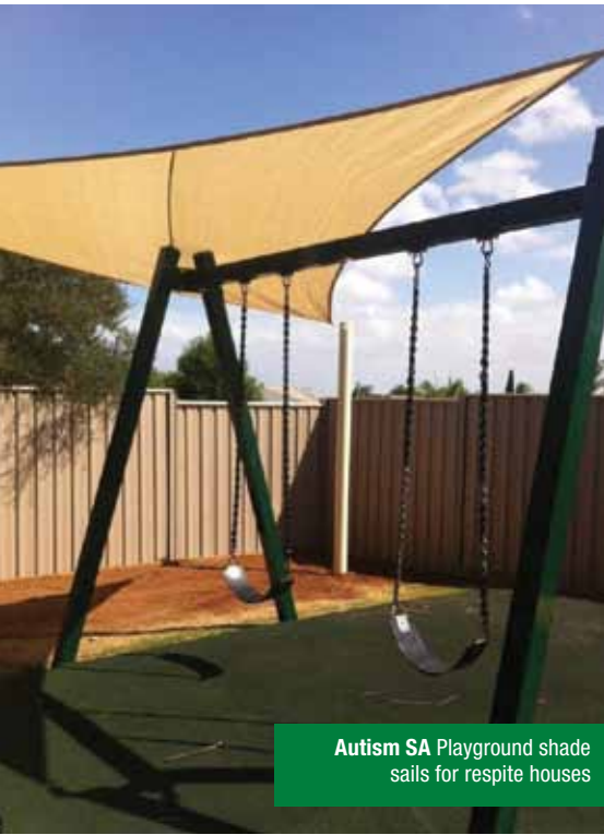
Autism SA Playground shade sails for respite houses

Selection of the past year's beneficiaries was based on the principles of the Foundation's Mission Statement and the merits of the projects submitted.