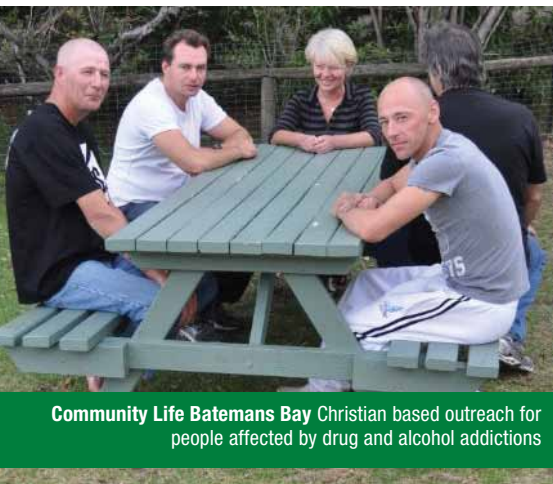
Community Life Batemans Bay Christian based outreach for people affected by drug and alcohol addictions