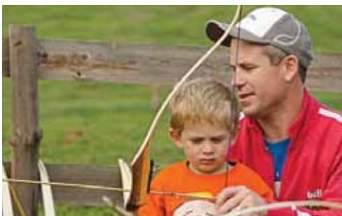
Camp Quality SA Family Camp for families whose kids have recently been diagnosed with cancer