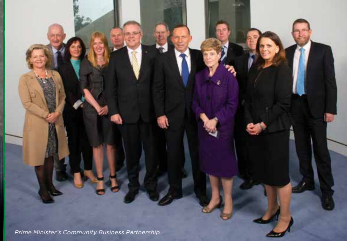
Prime Minister's Community Business Partnership