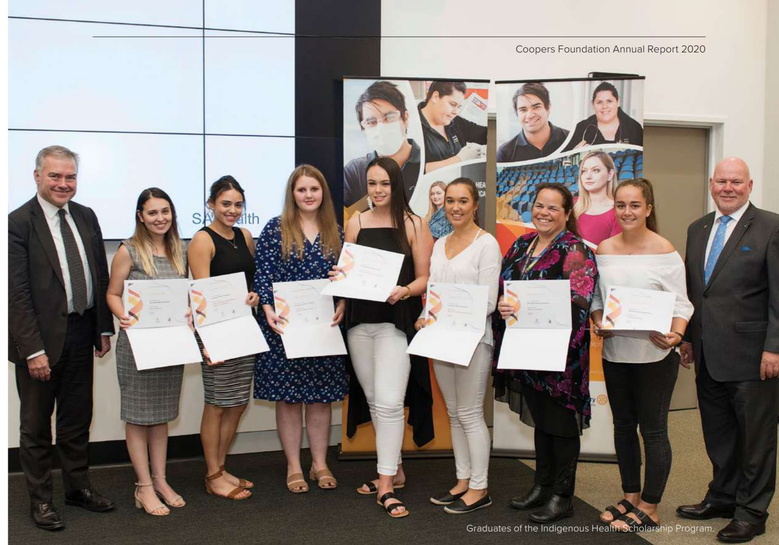
Graduates of the Indigenous Health Scholarship Program.

“ COMING FROM A RURAL AREA MYSELF I HAVE A DEEP UNDERSTANDING OF THE DIFFICULTIES FACED BY THE LACK OF HEALTH CARE IN THESE AREAS AND HOPE TO ASSIST WITH THIS ISSUE.